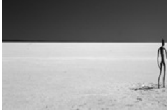
Inside Australia , Hugh Brody, 2004