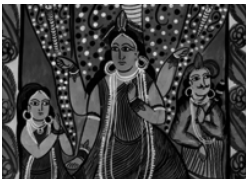
Singing Pictures – Women Painters of Naya , Lina Fruzzetti, Ákos Östör, 2005